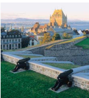
Chateau Frontenac and Quebec City from the Citadel