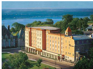
Chateau Laurier, Quebec City