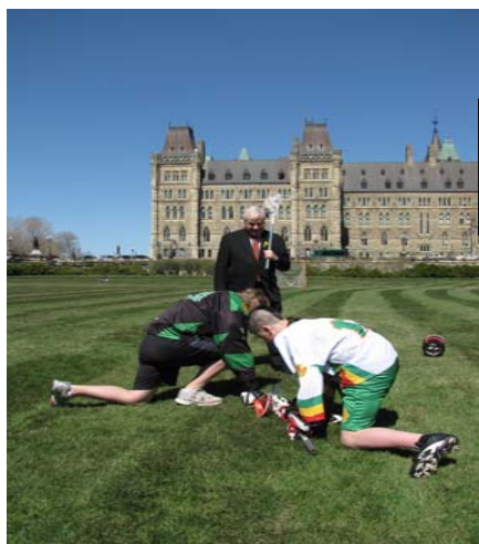
The Honourable Peter Milliken, Speaker of the House participated in the ceremonial face off before question period.