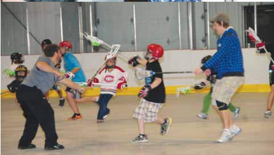
Running the gauntlet: the kids try to stick handle around the instructors who try to knock the ball away.