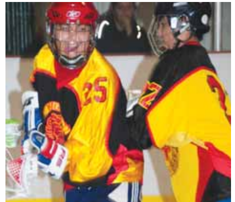
The Iqaluit Knights: The Nepean Knights donated equipment, sticks, nets and jerseys to the camp.