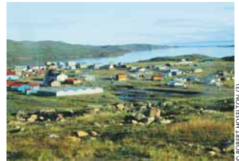
NorthStar launched its first camp in Iqaluit.